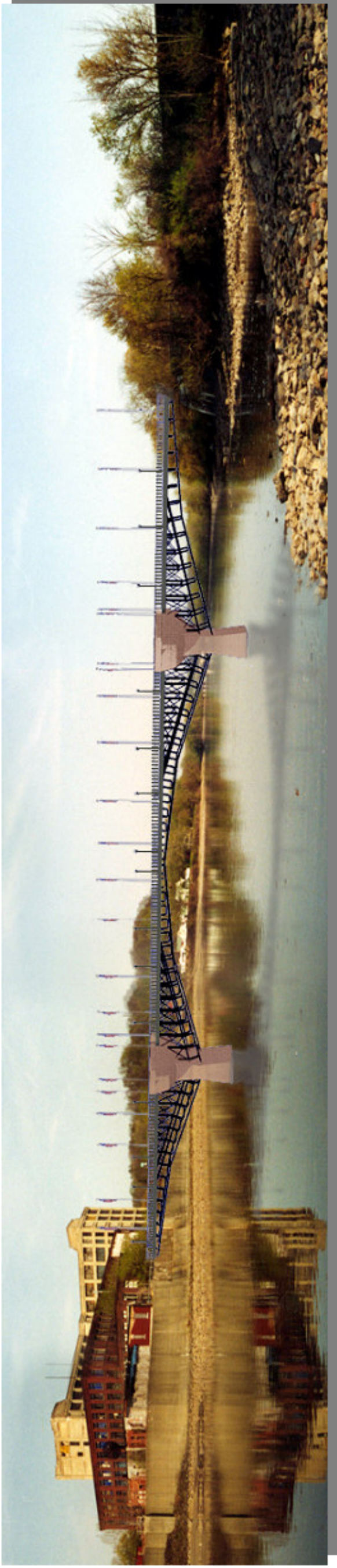
PANORAMIC VIEW OF BRIDGE – LOOKING WEST FROM VICINITY OF THE ROUTE 30 BRIDGE