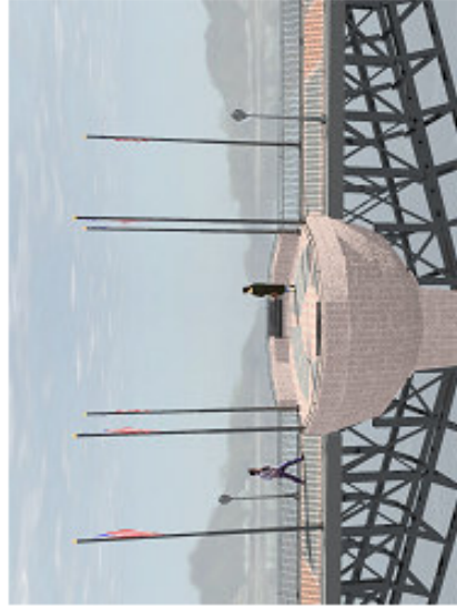
BIRD'S EYE PERSPECTIVE