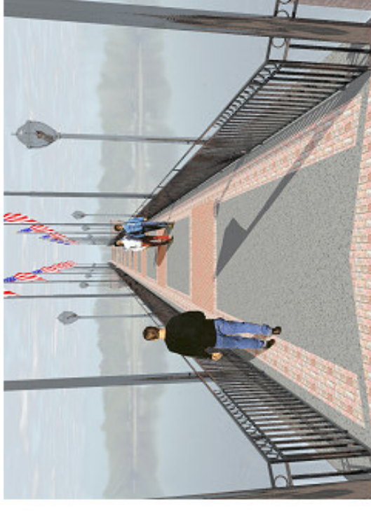
VIEW FROM PLATFORM LOOKING TOWARD SOUTH SHORE